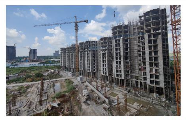
Budget 2022 - Expectations from the government for a strong realty growth

The Finance Minister Nirmala Sitharaman will table the Union Budget 2022 on 1st February and the realty sector is pinning high hopes. The growth-oriented steps taken by the government have helped the sector regain momentum and more announcements in this direction can boost the market sentiments further.