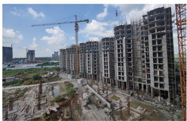
Budget 2022 - Expectations from the government for a strong realty growth

The Finance Minister Nirmala Sitharaman will table the Union Budget 2022 on 1st February and the realty sector is pinning high hopes. The growth-oriented steps taken by the government have helped the sector regain momentum and more announcements in this direction can boost the market sentiments further.