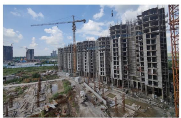
Budget 2022 - Expectations from the government for a strong realty growth

The Finance Minister Nirmala Sitharaman will table the Union Budget 2022 on 1st February and the realty sector is pinning high hopes. The growth-oriented steps taken by the government have helped the sector regain momentum and more announcements in this direction can boost the market sentiments further.