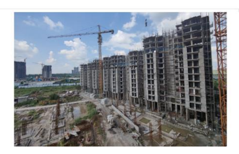
Budget 2022 - Expectations from the government for a strong realty growth

The Finance Minister Nirmala Sitharaman will table the Union Budget 2022 on 1st February and the realty sector is pinning high hopes. The growth-oriented steps taken by the government have helped the sector regain momentum and more announcements in this direction can boost the market sentiments further.