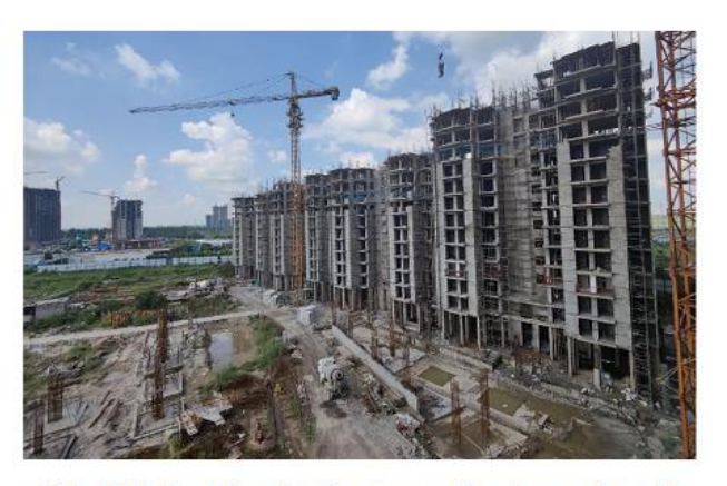
Budget 2022 - Expectations from the government for a strong realty growth

The Finance Minister Nirmala Sitharaman will table the Union Budget 2022 on 1st February and the realty sector is pinning high hopes. The growth-oriented steps taken by the government have helped the sector regain momentum and more announcements in this direction can boost the market sentiments further.